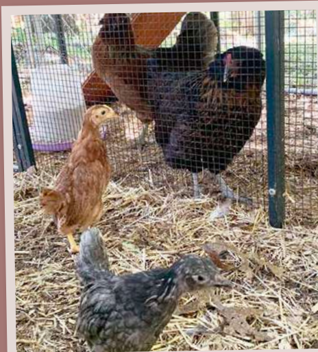
Our four chickens are of varying ages! The two oldest are Dolly and Aunt T (named after our Aunt Terri), and the babies are Madge and Blue.

Holly is our house cat, going strong at 13 years old! She mostly hides in José's closet, but when she does emerge, she's always warm and playful.