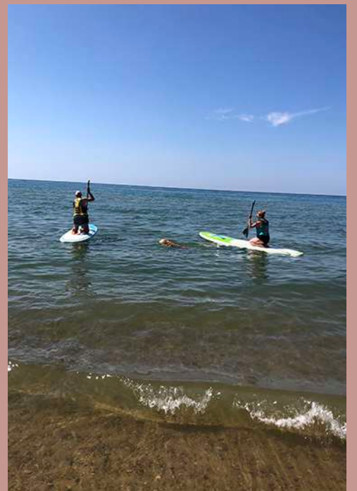
Paddleboarding on the lake.