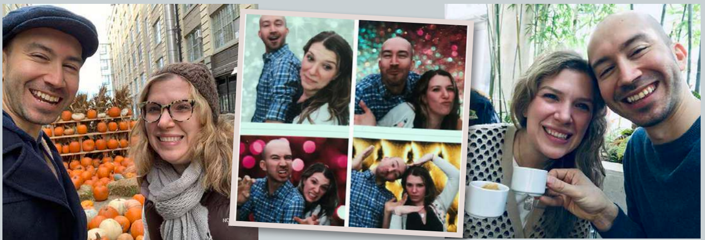
Enjoying the beginning of fall (our favorite season) in Brooklyn's Industry City