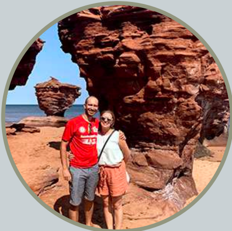
THUNDER COVE, PEI