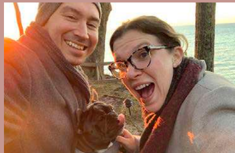
We always have a nice lookout from the sunset deck.