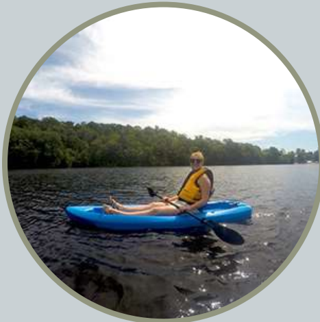
CEDAR LAKE, CT