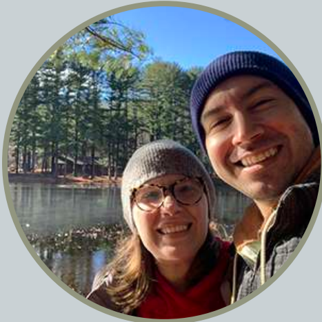
CHATFIELD HOLLOW, CT